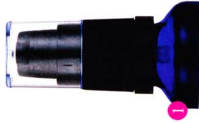
LUCY RUSSELL ORGANICS